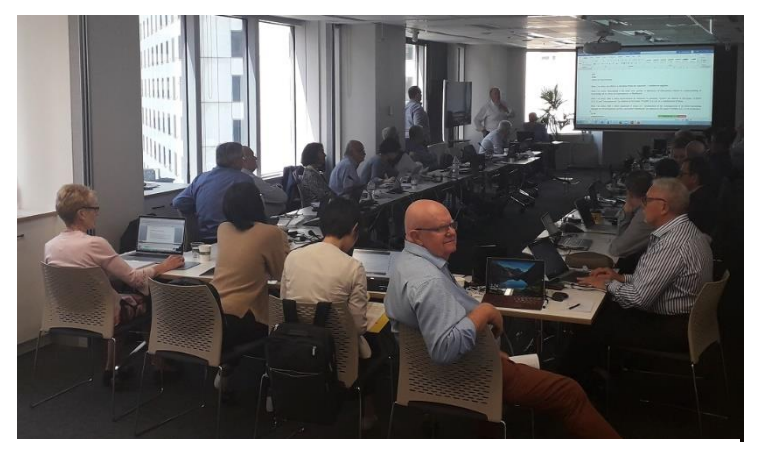
TF 14 participants in the meeting room (with also screens on the right-hand side)

been established in Vienna were requested to provide their reports and recommendations on the feasibility of eliminating the definition of 'risk' from Annex L entirely; issues surrounding the use of the verbs 'maintain', 'retain' and 'keep' as they relate to 'documented information'; and a deeper analysis of the term 'requirement' as it relates to management systems.