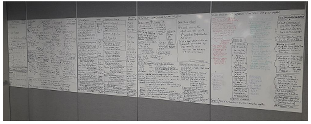
One of the TF 14 participants did a great job in capturing the discussion on the whiteboard

For several suggestions, it was concluded that they are beyond the limited scope of the project specification or are discipline specific. These suggestions will again be considered when working on Appendix 3. They will also be archived for potential consideration in future, more extensive revisions of Annex L.