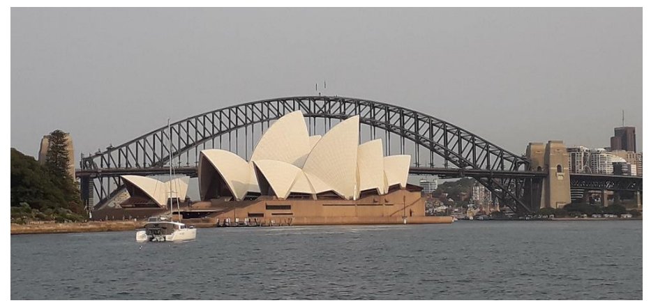
Sydney Harbour Bridge and Opera House – Two landmarks that also symbolise the goals and dynamics of TF 14 (i.e. reaching consensus by bridging different views and keeping good harmony)

One of the most important tasks for TF 14 at this meeting was to resolve the definition of 'risk'. This was one of the priority topics defined in the project specification and had been extensively debated throughout 2019. At the Vienna meeting (in July 2019) the option of having no definition was discussed as a possible way forward. It was agreed that a sub-group would prepare a 'white paper' to elaborate on the feasibility of this option, and how it might affect the remaining text in appendices 2 and 3 of Annex L. In Sydney, the sub-group provided its report describing the risk-based approach and risk management concept, and addressing opportunities and threats within the HLS. Following a very lively and informed discussion, it was concluded that the option for removing the definition of risk would